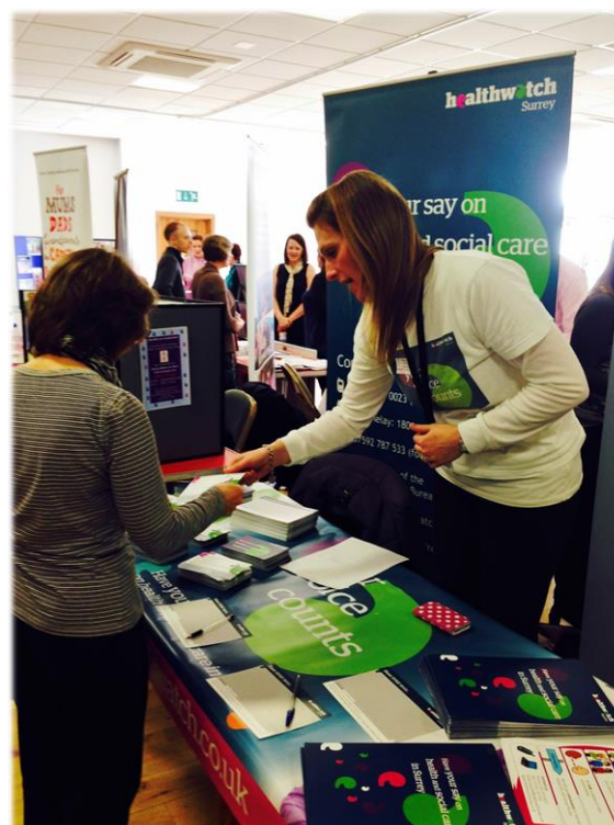
Picture: Information stand at the Family Voice Conference

There are a significant number of people in Surrey who we believe are seldom heard. The Healthwatch Surrey Board identified and prioritised two communities for 2014/15 with whom we did some focussed work. These were Young People and the Black & Minority Ethnic community.